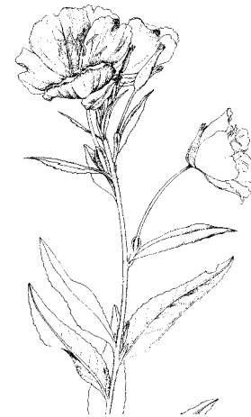
EVENING PRIMROSE ( Oenothera biennis )

Common cinquefoil Potentilla simplex Common milkweed Asclepias syrica Compass plant Silphium laciniatum Creeping Jacob's ladder Polemonium reptans Dense blazing star Liatris spicata Dog Violet* Viola conspersa Early goldenrod Solidago juncea Early meadow rue Thalictrum dioicum Evening Primrose Oenothera biennis False dragon flower Physostegia virginiana False rue anemone Isopyrum biternatum False Solomon's seal Smilacina racemosa Feathery false Solomon's seal Smilacina racemosa Fire pink Silene virginica Fleabane daisy Erigeron philadelphicum Flowering spurge Euphorbia corollata Forked Aster* Aster furcatus Foxglove beardtongue Penstemon digitalis Golden Alexander Zizia aurea Grass of Parnassus Parnassia glauca Grass Purple Orchid* Calopogon tuberosus Harebell Campanula rotundifolia Indian grass Sorghastrum nutans Indian pipe Monotropa uniflora Indian strawberry Duchesnea indica Jack-in-the-Pulpit Arisaema triphyllum Lakeside Daisy Hymenoxys acavlis var. Glabia Large-flowered bellwort Uvularia grandiflora Large-flowered trillium Trillium grandiflorum Lobelia Lobelia cardinalis Marsh fleabane Erigeron philadelphicus Marsh marigold Caltha palustris Mayapple Podophyllum peltatum Meadow parsnip Thaaspium trifoliatum Michigan lily Lilium michiganense Nodding wild onion Allium cernuum Northern blueflag iris Iris versicolor