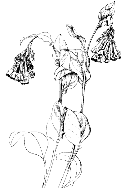
VIRGINIA BLUEBELLS ( Mertensia virginica )

Tradescantia ohiensis Liatris spicata Eupatorium maculatum Apocynum androsaemifolium Claytonia virginica Cardamine bulbosa Silene stellata Smilacina stellata Solidago rigida Ranunculus septentrionalis Lysimachia terrestris Asclepias incarnata Cacalia suaveolens Anemone virginiana Potentilla arguta Coreopsis tripteris Solidago altissima Dentaria laciniata Chelone glabra Krigia biflora Oxalis violacea Mertensia virginica Hydrophyllum virginianum Veronia fasciculata Actaea pachypoda Erythronium albidum Erigeron philadelphicus Monarda fistulosa Aquilegia canadensis Allium canadense Geranium maculatum Asarum canadense Camassia scilloides Allium tricoccum Aralia nudicaulis Anemone quinquefolia Helianthus divaricatus Oxalis europaea