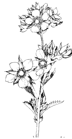
TALL CINQUEFOIL ( Potentilla arguta )